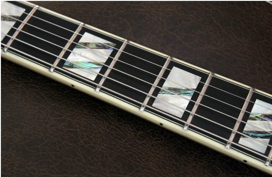
Conti Entrada archtop fret inlay

The Entrada is a versatile instrument but obviously designed by a jazz player who has made a career playing other brands of high-quality archtops and finally decided to combine all of the features of importance to him in his own house brand. The tone is rich and full electrically, and the stability of the laminate body makes it a roadworthy guitar as well. Sustain is impressive, and the individual string tension adjustment gives the player the ability to truly fine-tune and customize the feel of the action. The unique cutaway design allows easy access to the upper register which is largely difficult to utilize on deeper body guitars. A huge plus that increases the possibilities for the player to reach both single note and chords up the neck.