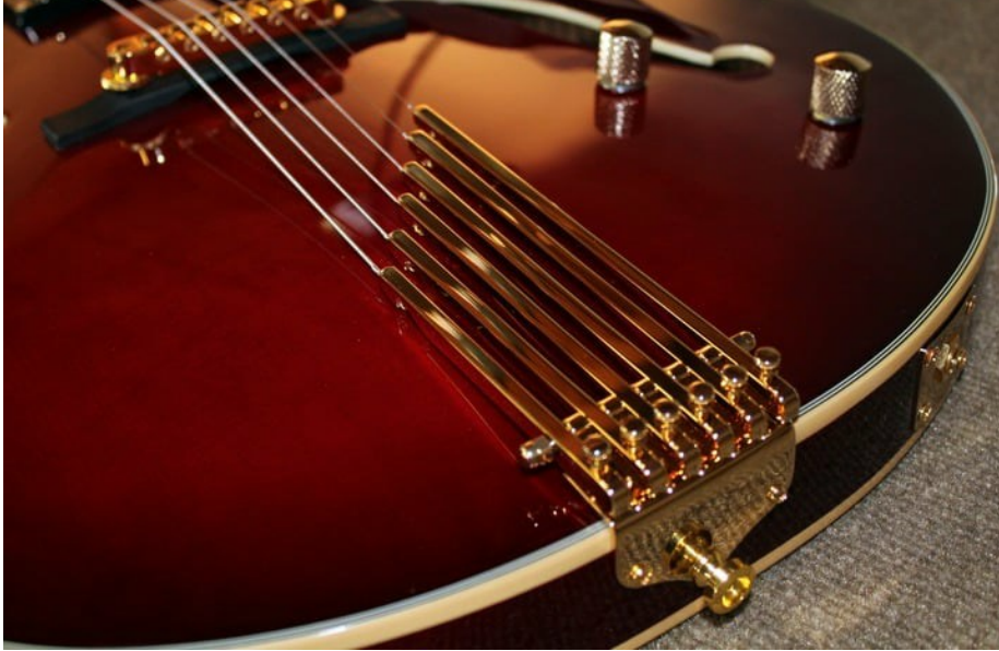
Conti Entrada archtop tailpiece

In terms of specs and features, the first look at the headstock with its Mother of Pearl flowerpot inlay, Imperial style tuners, and Ivory and Black binding is total class. The neck is Maple, with a 15.75" Radius, 24.6" Scale Length, and bone nut. The gorgeous ebony fingerboard is bound with ivory and black and inlaid with Mother of Pearl and abalone. Nut width is 1.69" and the 24 fret neck joins the body at the 16 th Fret.