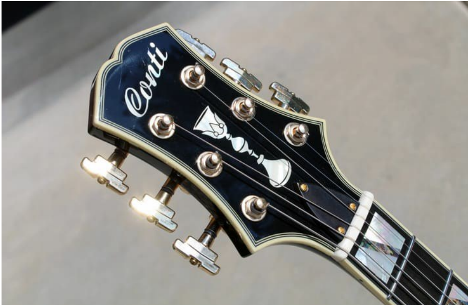
Conti Entrada archtop headstock

There are several options to choose from when it comes to the appointments. The floating ebony bridge base is standard, with a choice of either a compensated ebony top or Gotoh/TonePros Gold Tune-o-Matic. The tailpiece can be either violin-style ebony, or the tension adjustable Gold Finger, which is my personal preference.